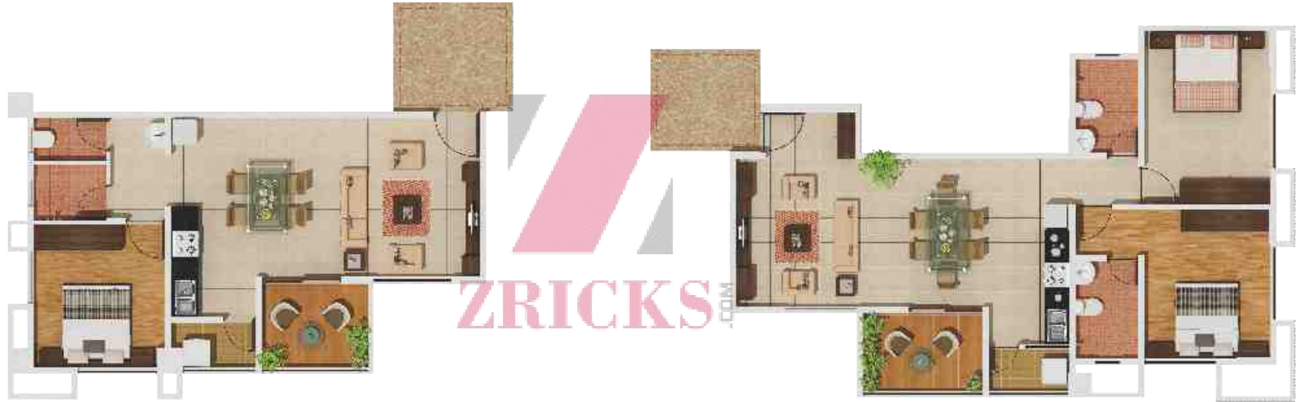
1 BHK AREA: 682 & 683 SQFT