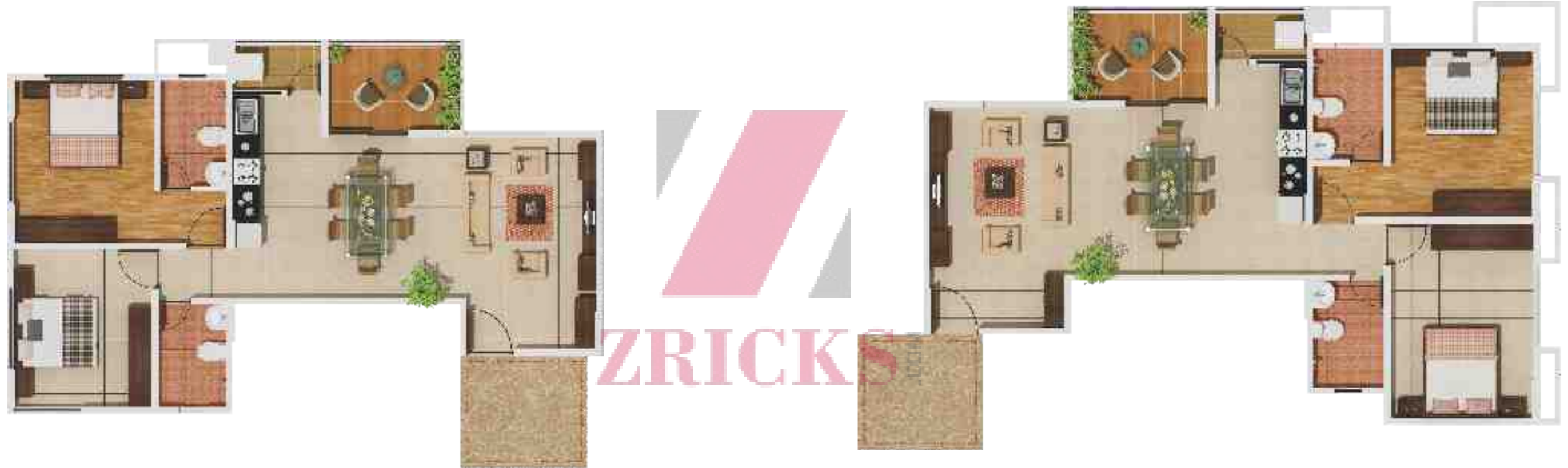
2 BHK AREA: 1032 - 1037 SQFT